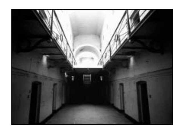
Armagh Gaol is Northern Ireland's oldest prison. It was built between 1780 and 1852,