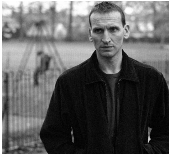
Christopher Eccleston as Joe Broughton